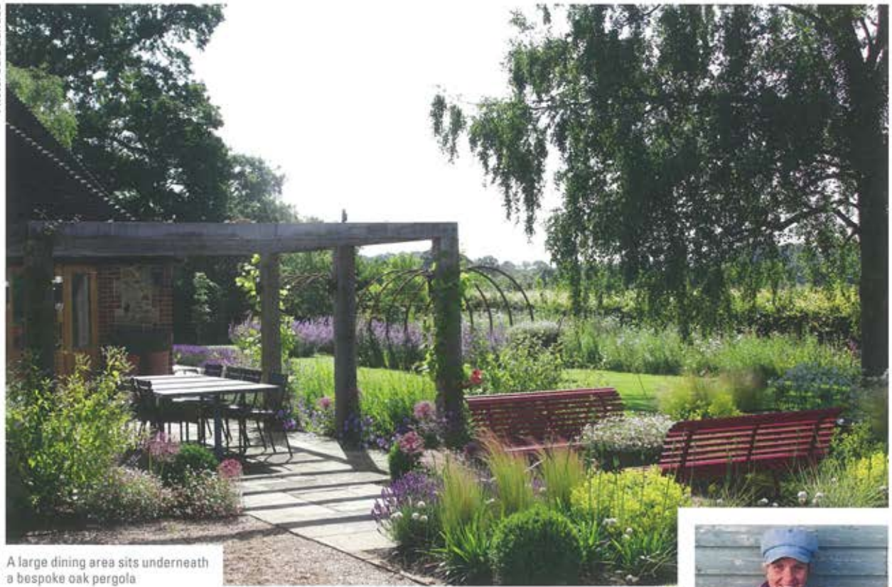
A large dining area sits underneath a bespoke oak pergola